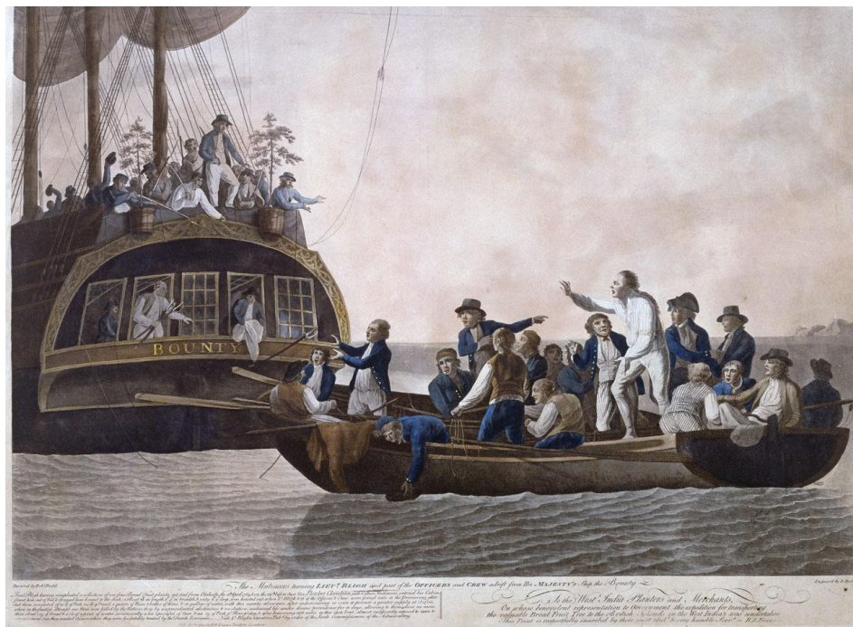
The mutineers turning Lt Bligh and part of the officers and crew adrift from HMAV Bounty , 29 April 1789, published by B. B. Evans: http://en.wikipedia.org/wiki/Mutiny

In England, regardless of whether a man actively participated in the mutiny or took no action to oppose it, he was charged as a mutineer. The act of mutiny was a violation of Article XIX of the Articles of War, and conviction for this meant probable death. The law stated that "If any Person in or belonging to the Fleet shall make or endeavour to make any mutinous Assembly upon any Pretence whatsoever, every Person offending herein, and being convicted thereof by the Sentence of the Court-martial shall suffer Death." In September 1794, the ten mutineer defendants of the HMAV Bounty who had been captured on Tahiti were given the verdicts of the court. Coleman, Norman, McIntosh, and Byrne received pardons due to personal letters from Bligh declaring them innocent of mutiny, whereas the other six (Burkett, Ellison, Heywood, Millward, Morrison, Muspratt) were found guilty and sentenced to be hung. Three were pardoned but three were hung. If the Pitcairn mutineers had been discovered they would definitely have been hanged, with Christian's crime being the greatest for being the leader. However, due to John Adams's success in founding and sustaining the Pitcairn community he was pardoned.