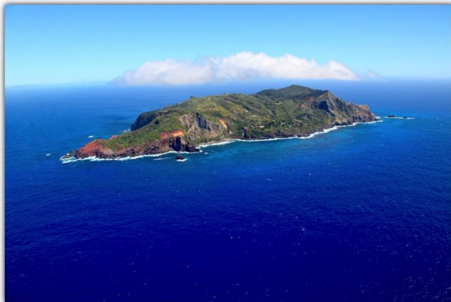
Aerial shot of Pitcairn Island

These resources are aimed at anyone with an interest in theatre wishing to gain a deeper understanding of the process it took to create this new production.