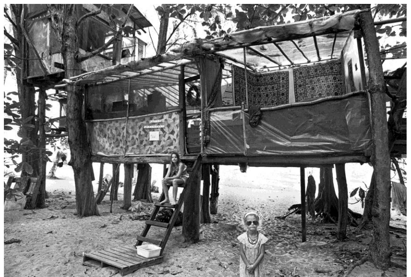
Taylor Camp, Kauai, Hawaii

Early on in Richard Bean's Pitcairn , Ned Young goes in search of fellow Bounty mutineer William Brown, who has been appointed the 'gardener' of the titular tropical island, to see if he has any yeast. Upon finding Brown, Young surveys the scene and exclaims: "Look at this! William, you have turned the Garden of Eden into... Norwich."